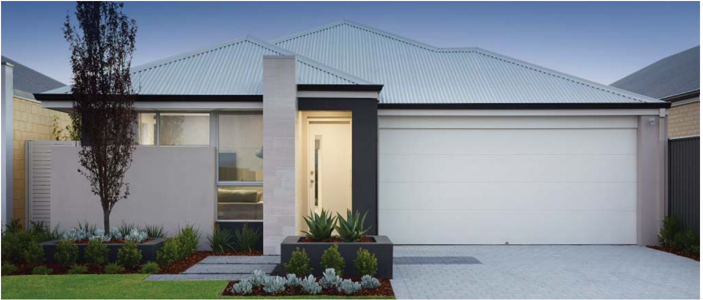
Drakesbrook Vista Estate, Waroona, WA, 6215 - The Gala