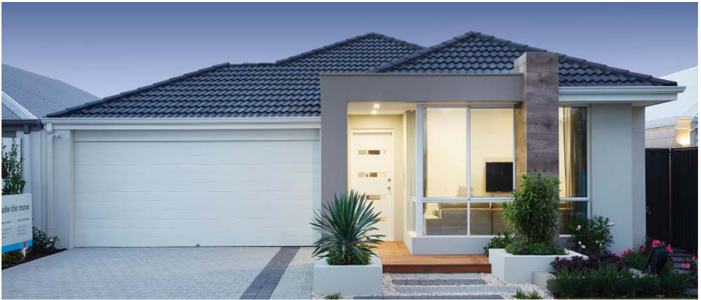
Drakesbrook Vista Estate, Waroona, WA, 6215 - The Manly