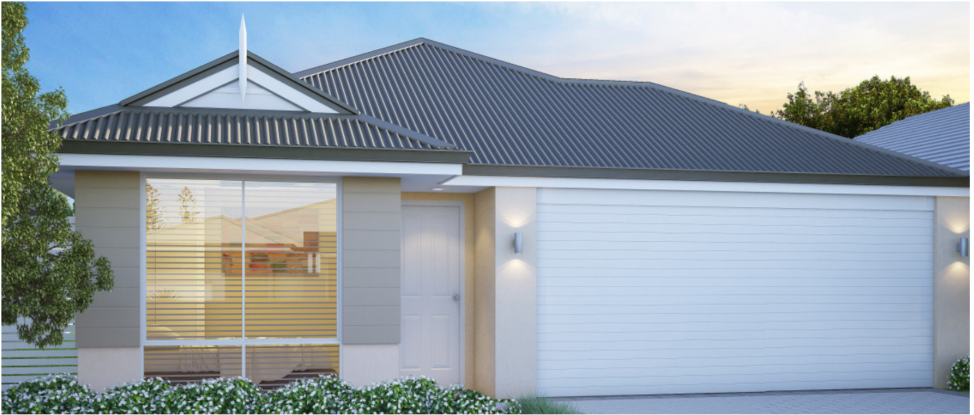
Drakesbrook Estate, Waroona, WA, 6215 - DESIGN The Nollamara